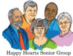
Happy Hearts Senior Group

Circle Meeting, Tuesday, February 7th Morning Circle (Go & Grow) 10:00am Evening Circle (Life Seekers) 7:00pm We will meet in the Parlor.