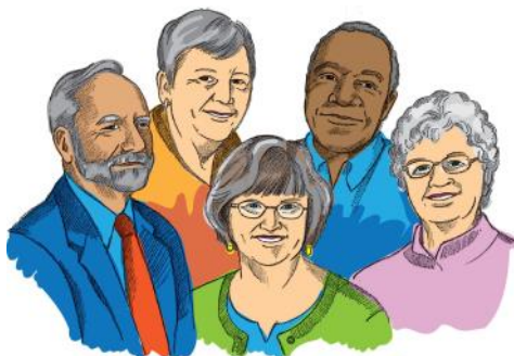
Happy Hearts Senior Group

Call 910-594-4702 or email rsvp@meckcoa.org to RSVP by Aug. 15 TH