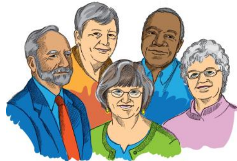
Happy Hearts Senior Group

**There will be no Monday Study Group during July.