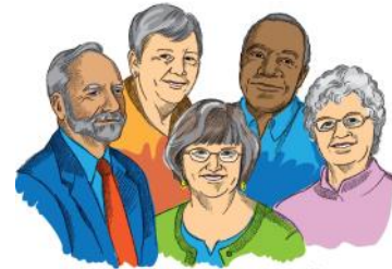
Happy Hearts Senior Group