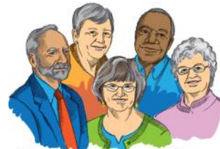
Happy Hearts Senior Group