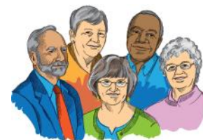
Happy Hearts Senior Group

The Presbyterian Women are holding a stuffed baked potato and salad luncheon in the CFC on Sunday, March 18th , following the Worship Service. Homemade desserts from the Circles will also be provided. A love offering for the activities to beautify the church will be collected. So, please plan to join us for good eats and fellowship!